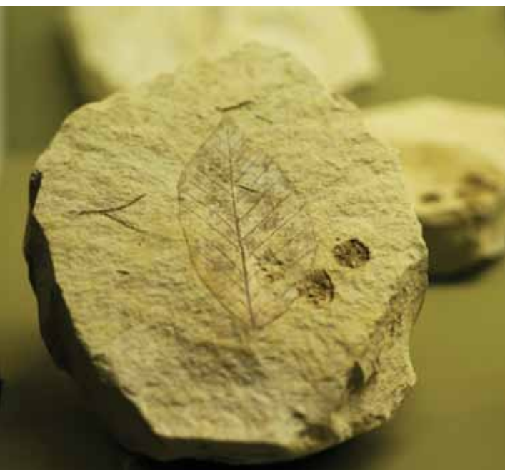
Goulandris Natural History Museum