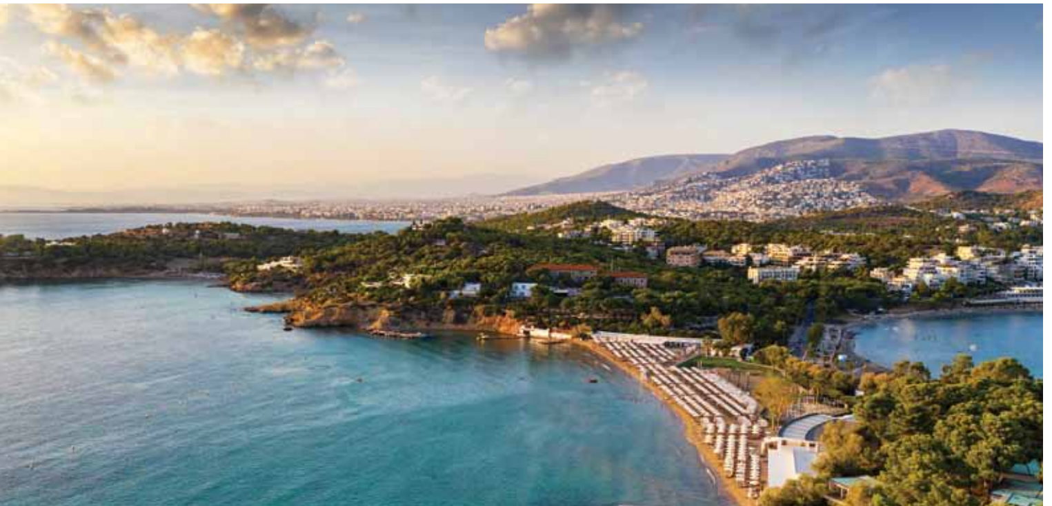
The Athenian Riviera

The Greek capital is a city that has it all; a vibrant cosmopolitan hub with a rich culture, a long history, and a mild climate; one that possesses an unfading allure, attracting tourists from all over the world and promising a memorable stay whether as a short break or a longer trip. Enjoy Athens' high standard hotel services and facilities, and make the most of the wide range of choice you have as regards recreation, nightlife, shopping and dining. Use the modern metro, tram and railway system to reach most destinations. Walk along the promenade by the foot of the Acropolis , visit the city