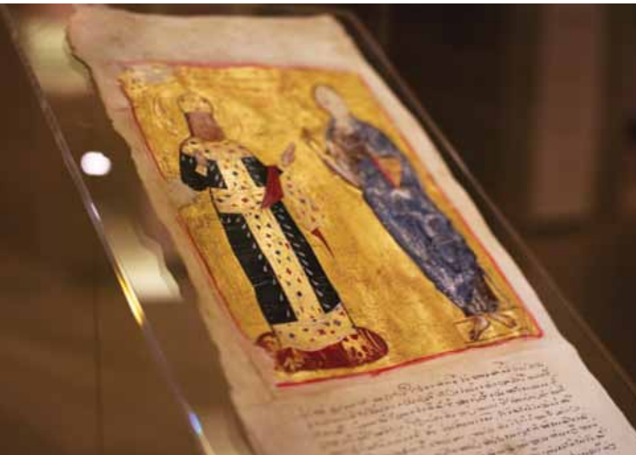
Byzantine and Christian Museum

Athens is known across the world as a city steeped in history and art. Choose it for your next city break and visit museums and galleries that will feed your cultural appetite. One of the oldest museums in Athens is the Benaki Museum , near Kolonaki Sq., with exhibits that range from prehistoric finds to recent works of art. The Byzantine and Christian Museum places an emphasis on the Byzantine and post Byzantine Period (from the 3 rd c. AD onwards). In the nearby Museum of Cycladic Art you