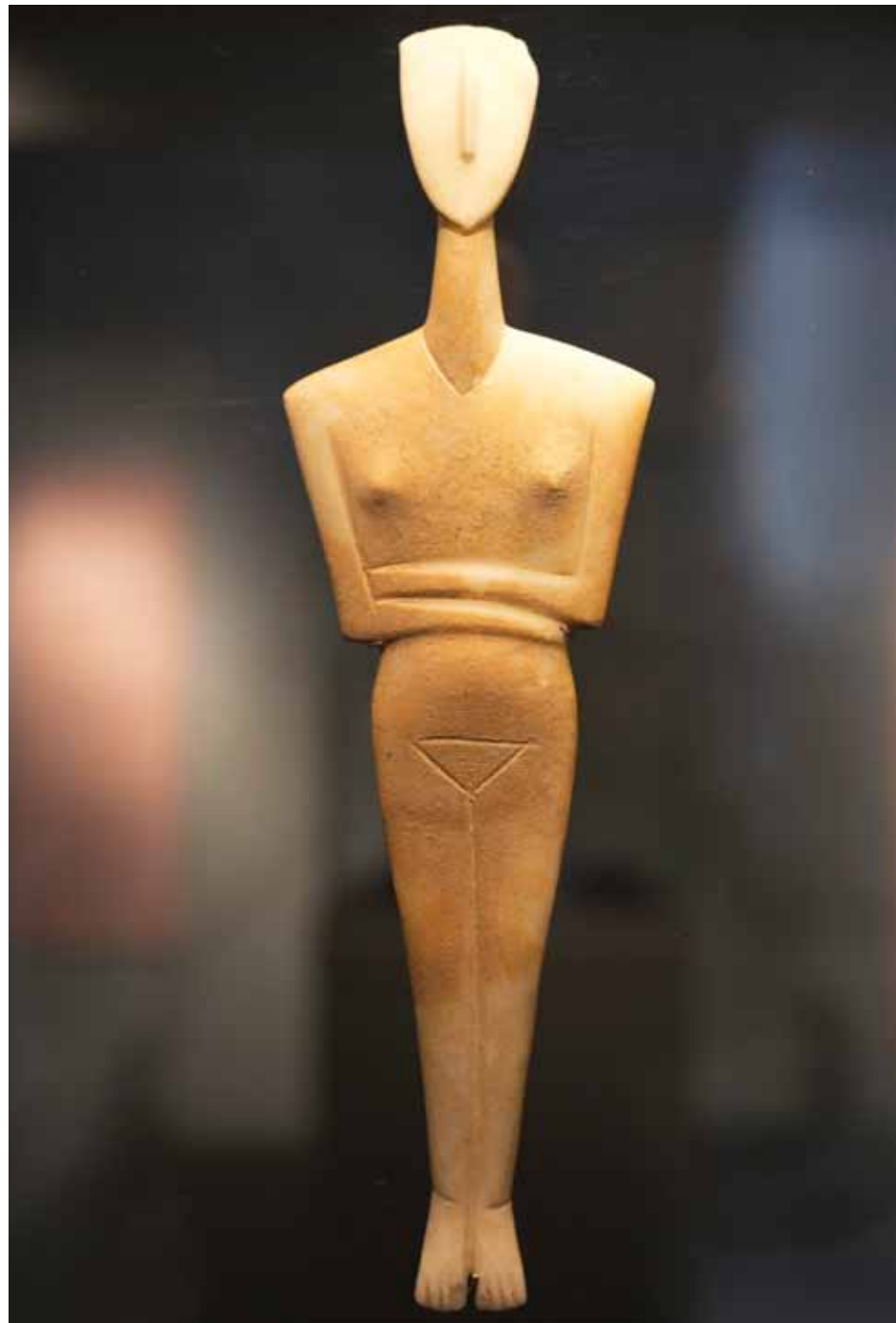
Museum of Cycladic Art