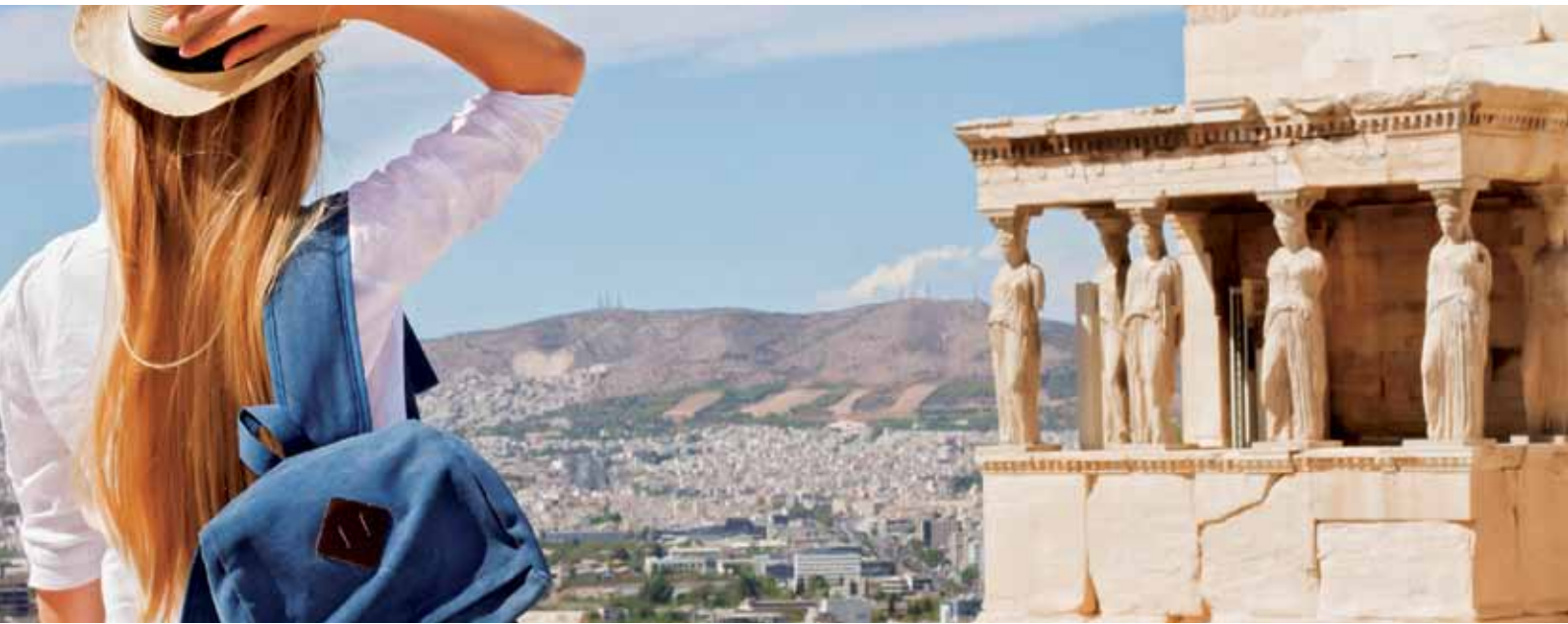
The Erechtheio, Acropolis

heritage site; visit the temple of the healer god Asclepius ; the 2 nd c. BC Stoa of Eumenes ; and the 161 AD Odeion of Herodes Atticus (a present-day venue for the yearly Athens Festival ). Climb on the Acropolis Rock and admire the Propylaea , Erechtheio , the temple of Athena Nike , and the Parthenon. The Acropolis Museum stands right opposite the Rock, where 4,000 items from the Acropolis monuments are on display. Continue your walk northwest and you will reach Areopagus , the oldest Court of Law in Athens. Your next stop is Pnyx , the place where Athenian citizens used to hold their democratic assembly. Visit the Ancient Agora , the then centre of political, administrative, commercial and social activity. Finally, head to Kerameikos , the city's ancient cemetery, and the nearby museum where impressive tomb sculptures are on display. Athens is an open air museum, so plan your trip ahead and spend your available time wisely.