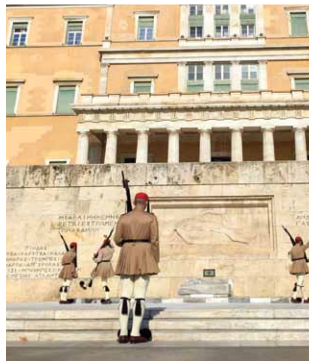
Tomb of the Unknown Soldier, Syntagma