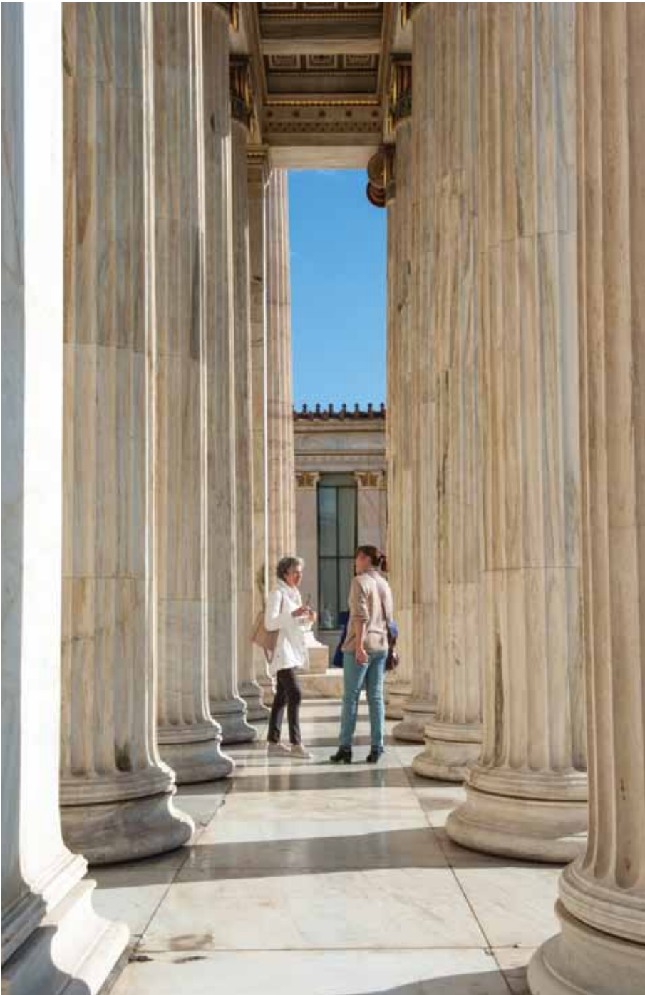
The Academy of Athens