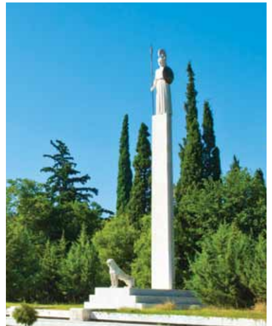
Pedion tou Areos