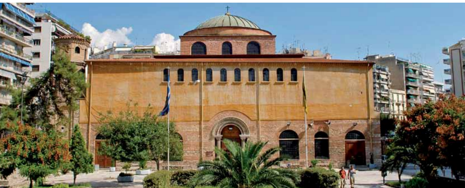
Saint Sophia Church