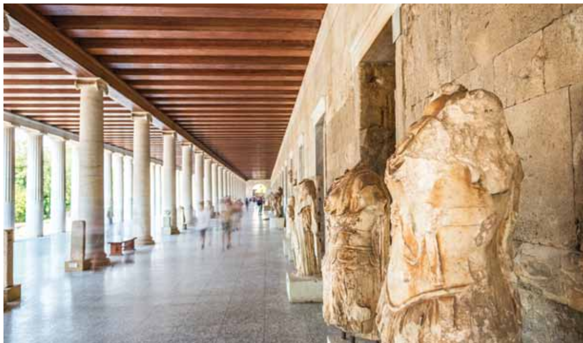
Stoa of Attalos