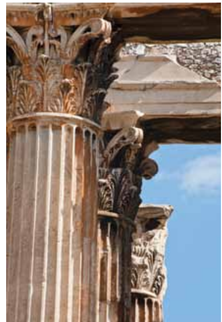
Temple of Olympian Zeus