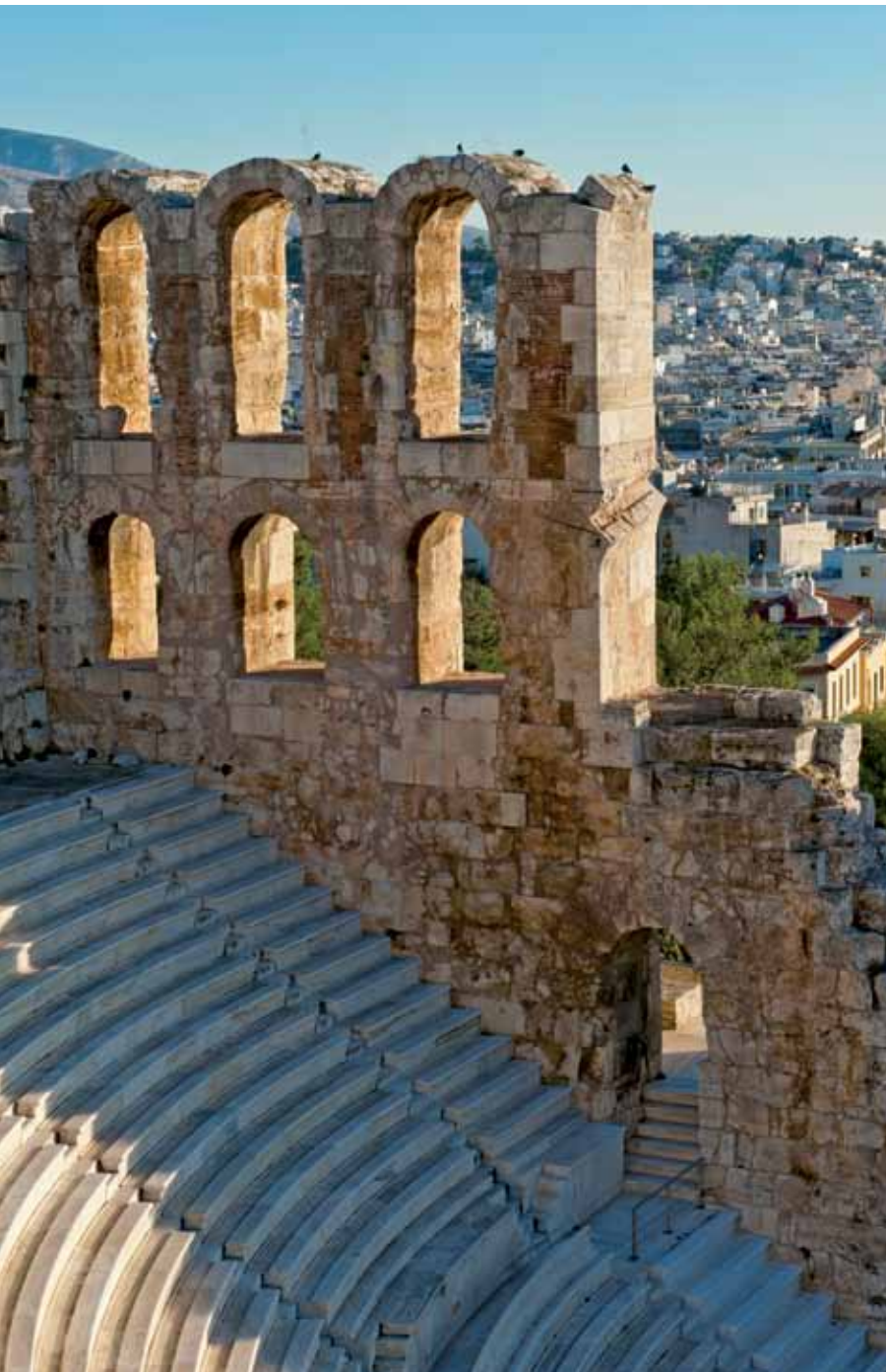
Odeion of Herodes Atticus

Ancient Athens is one of Europe's oldest cities, one with a continuous history whose beginnings can be traced some 5,000 years ago. The Greek capital is known as the cradle of democracy. Ancient Athenians have nurtured and advanced science and art and provided the basis for western culture. Take a stroll along Dionysiou Areopagitou St. Visit the temple of Olympian Zeus (6 th c. BC), next to Hadrian's Arch (131 AD). Follow the 3km pedestrian route. Start with the 5 th c. BC ancient theatre of Dionysus ; continue along the foot of the Acropolis - a world-renowned UNESCO world