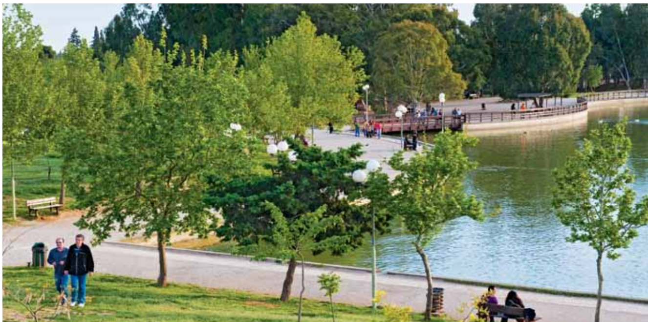
Antonis Tritsis Environmental Awareness Park