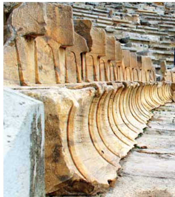
Ancient Theatre of Dionysus