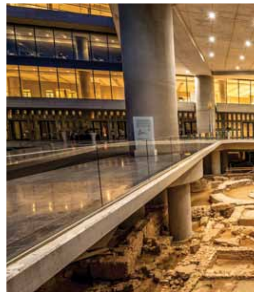
The Acropolis Museum