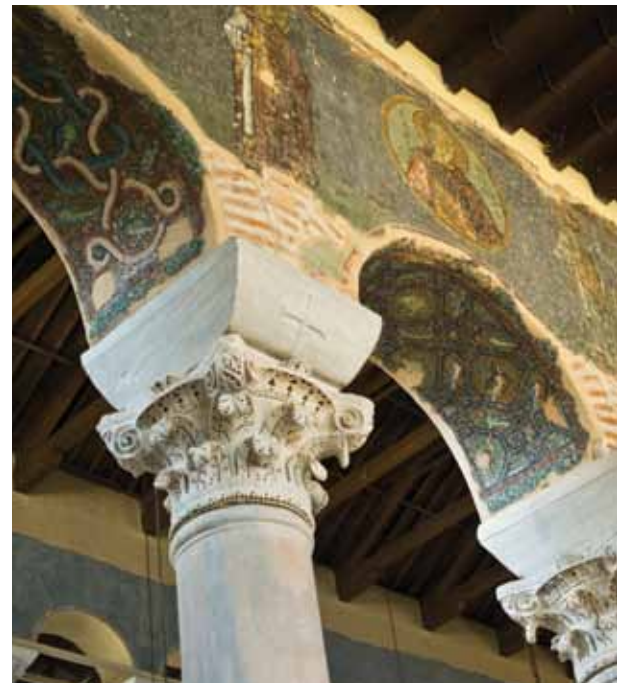
Panagia Acheropoiitos Church