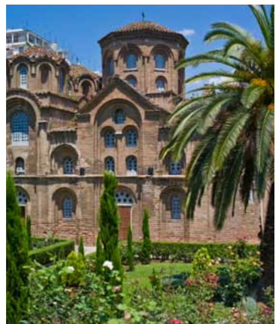
Panagia Chalkeon Church