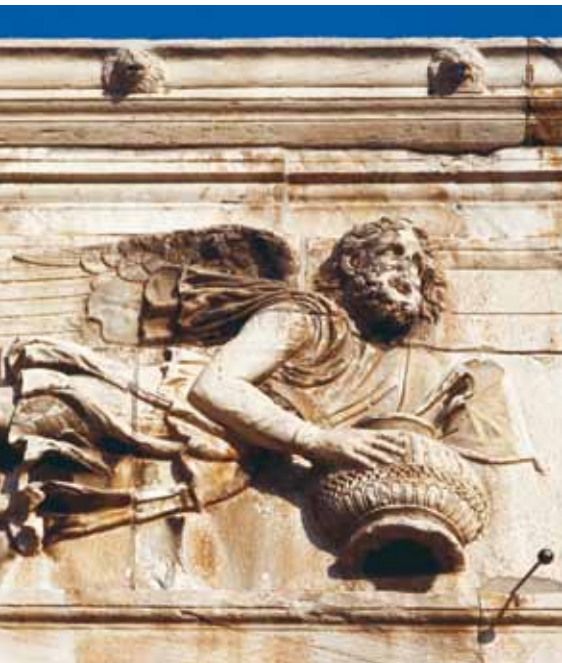
The Tower of Winds, Roman Forum

is a lively flea market (on Sundays), and stroll in pedestrianised Pandrosou and Adrianou Sts. From Monastiraki Sq. head northwest to Psyrri , one of the oldest neighbourhoods in Athens, that stretches around Iroon Sq. Choose one of the local traditional tavernas and enjoy your dinner listening to bouzoukia, a type of popular Greek urban folk music. Makrygianni neighbourhood is an area with many neoclassical imposing buildings. Thiseio district lies northwest of the Acropolis area and it, too, brims with culture. Visit the temple of god Hephaestus , the National Observatory of Athens on Nymphon Hill, the Herakleidon Museum , and the 11 th c. Agion Asomaton Byzantine Church . The Benaki Museum of Islamic Art neighbours Kerameikos archaeological site and the Ancient Agora . Another district with an atmosphere is Gazi , an area named after the 19th century gas works that provided the city with gaslight up to a century ago. This is where the city's Technopolis cultural centre is located. Visit the premises where the Industrial Gas Museum is housed, and pick from a wide range of cultural events and exhibitions hosted there around the year.