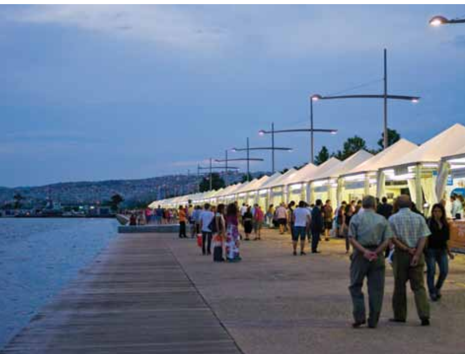
Thessaloniki Book Fair booths