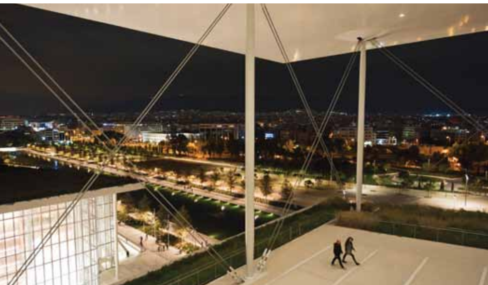
Stavros Niarchos Foundation Cultural Centre