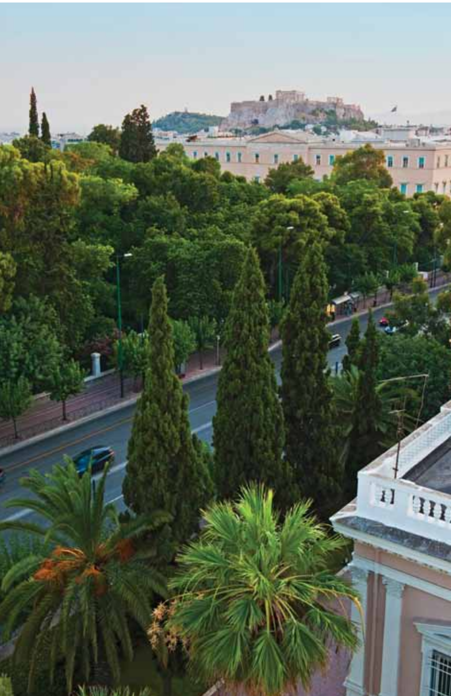
Vasilissis Sofias Avenue

A favourite tourist destination is Syntagma Sq. , where the Greek Parliament is located with the