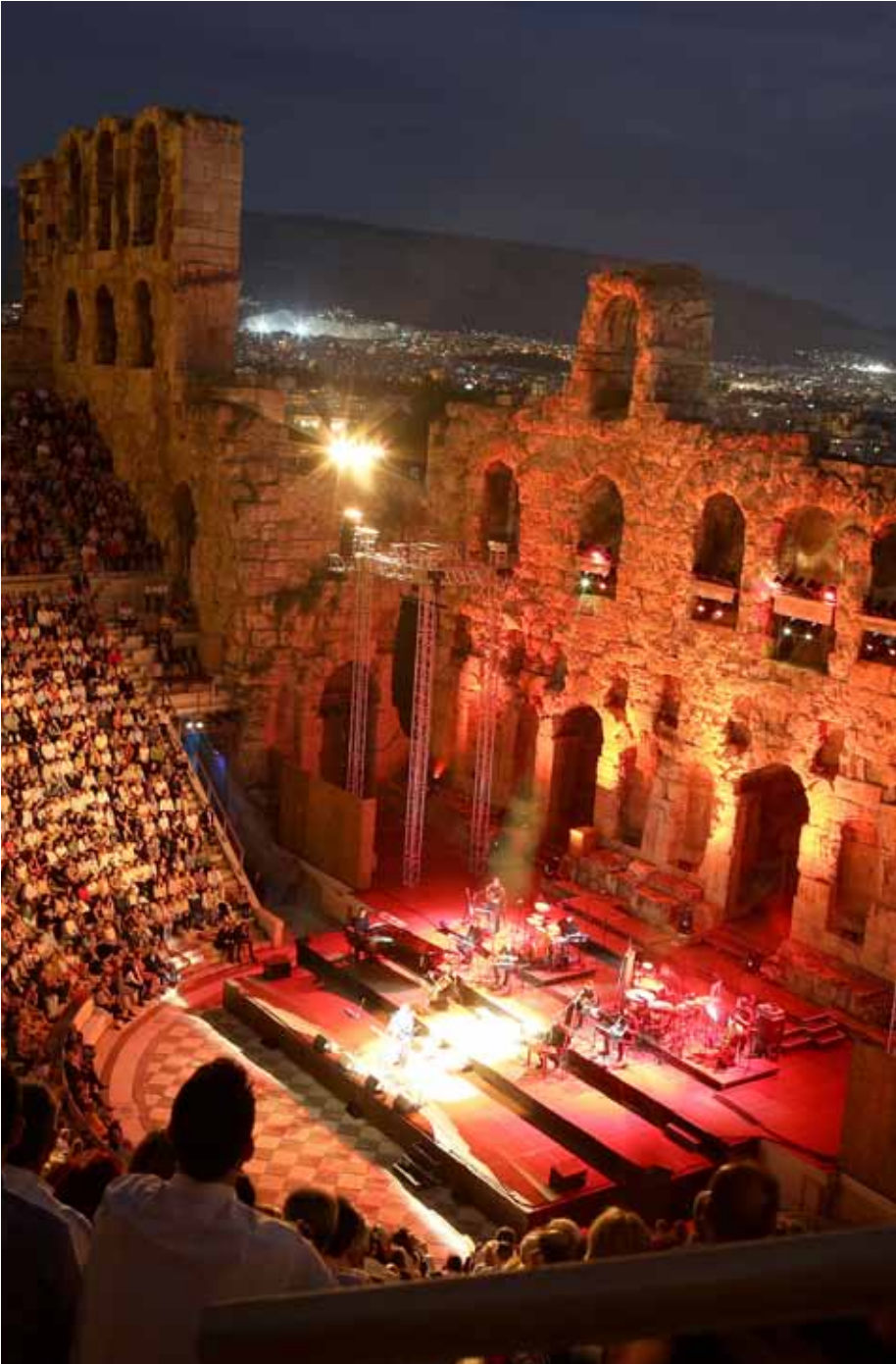
Odeon of Herodes Atticus