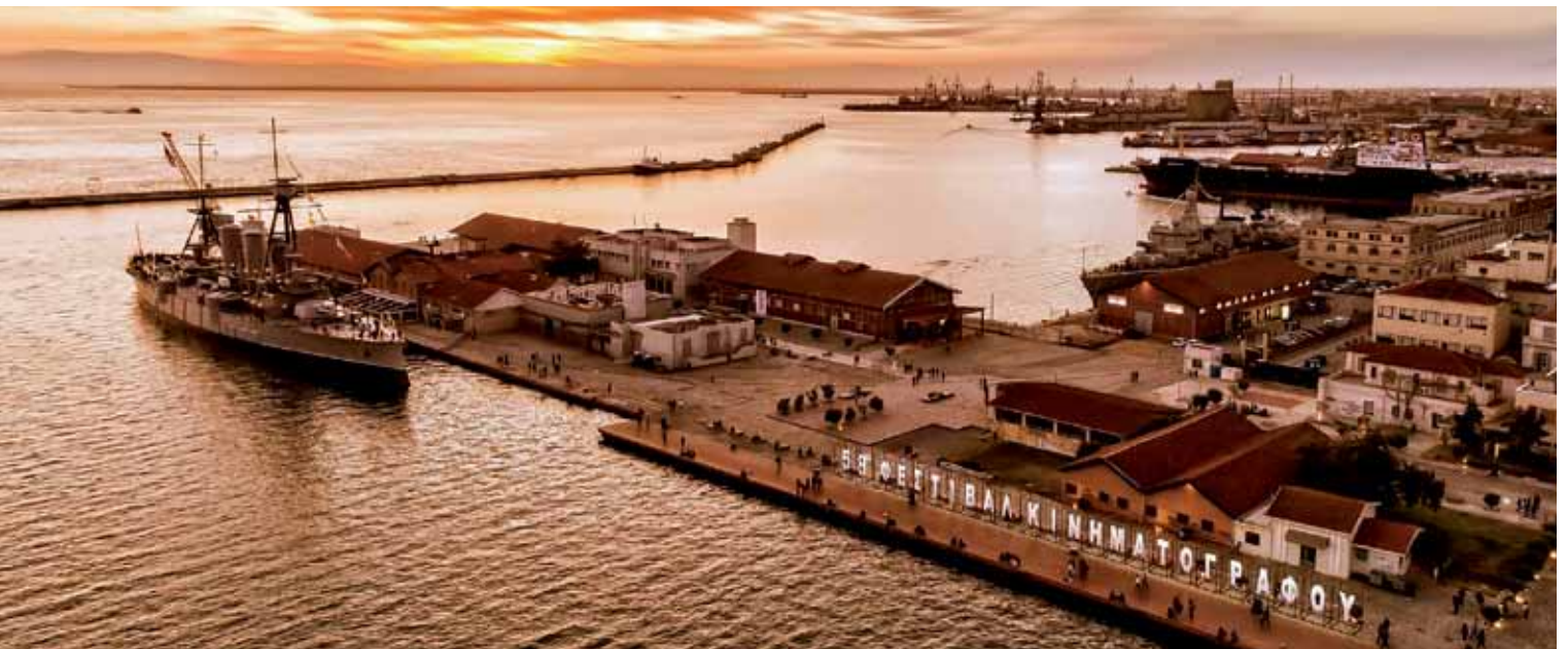
Thessaloniki International Film Festival facilities

Thessaloniki is a historic port city and a bustling modern metropolis. The capital of Macedonia was established by Cassander, its first king, and named after his wife, the sister of Alexander the Great. The city's 23 centuries of continuous existence were marked by periods of great prosperity alternated with wartime and occupation. Thessaloniki was the most important city in the Byzantine Empire –